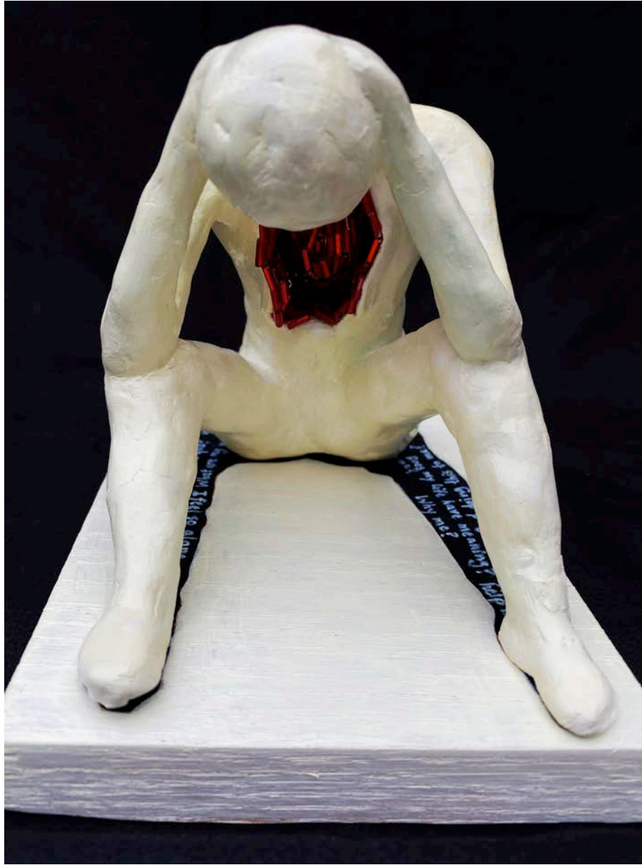
© Facing a New Diagnosis Gavisha Waidyaratne Spring 2022 Intima

This piece is made of clay, red glass bugle beads, acrylic paint, and wood. The dimensions are roughly 6"x4"x4"