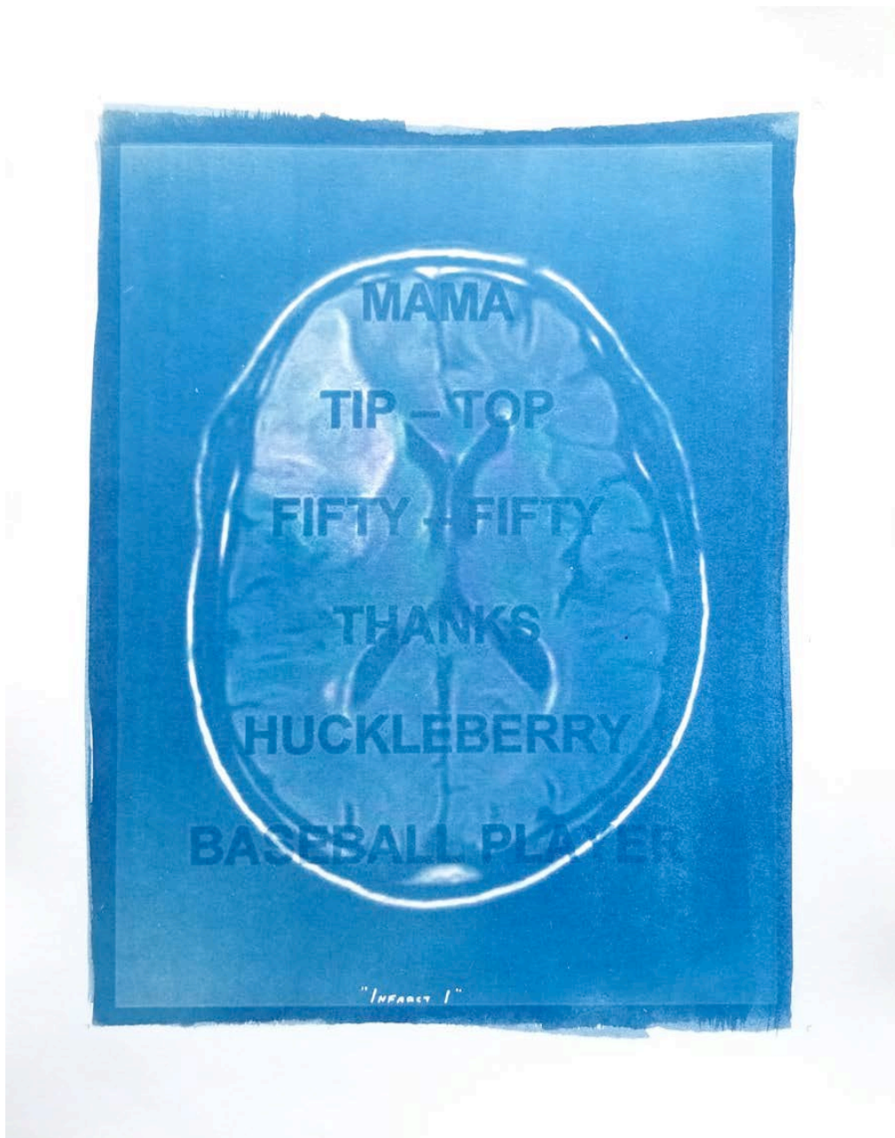
© Infarct I . Steven Scaglione. Cyanotype